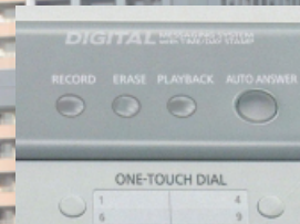
Fully Digital Answering System*