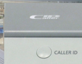
Caller ID*1 Ready