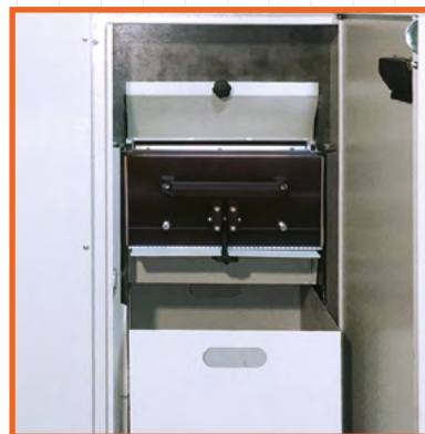
Easy access to cutting units and waste container