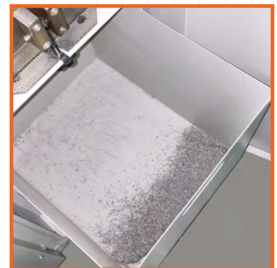
Easy removal and emptying of waste container