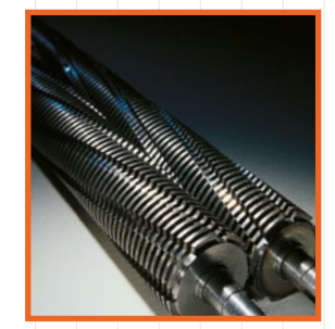
CARBON HARDENED STEEL CUTTING KNIVES unaffected by staples and clips