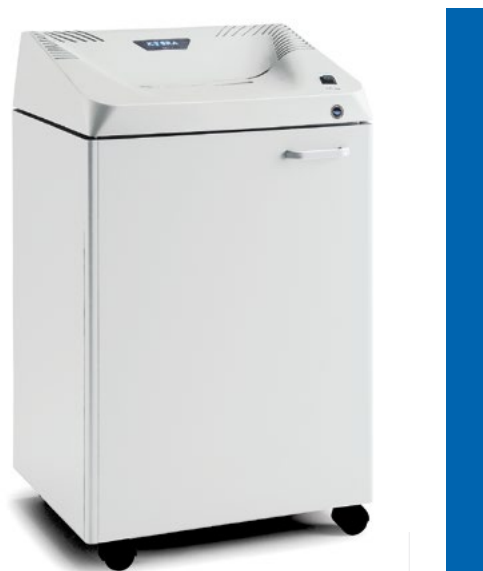
CERTIFICATION MARKS: CB - CSA - CE

APPROVED FOR UK GOVERN USE, FOR DETAILS CONTACT CPN