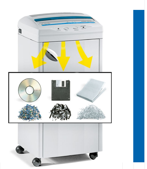
CERTIFICATION MARKS: CB - CSA - CE