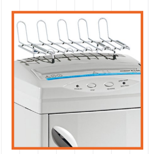
TOP SHELF (OPTION) Document top shelf to save office space (space saving design)