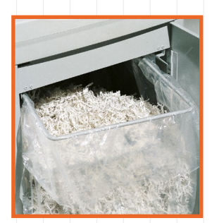
FRONT DOOR FOR EASY EMPTYING of collection bag (capacity of 1.000 sheets in straight cut)

CARBON HARDENED STEEL CUTTING KNIVES unaffected by staples and clips.