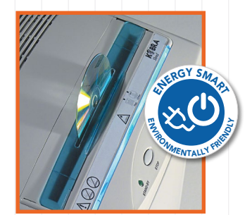
ENERGY SMART® Power management system with illuminated indicators for power