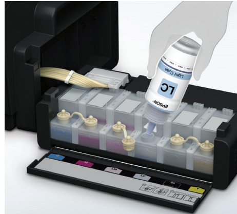
Specially fitted tubes ensure reliable ink flow without leakage

Epson's original ink tank system is engineered for easy, mess-free refills. The special tubes in the printer are designed to ensure smooth and reliable ink flow at all times.