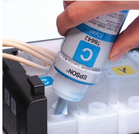
Smart tip design for easy, mess-free refills

The L1800 supports printing to a wide variety of printing media from 4R photo prints all the way up to A3+ sizes, allowing you to accomplish all your printing jobs, from the simplest to the most demanding.