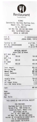
Customize receipts with the restaurant's logo